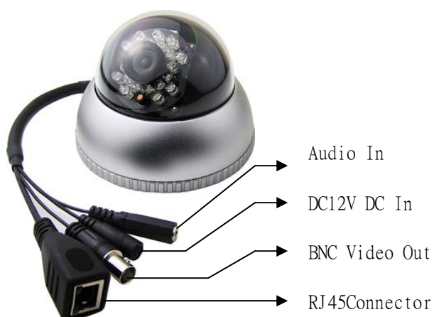
Production appearance and connector